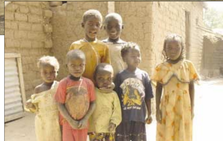
Poorest of the poor ... Children smile for the camera in Korobo, Chad.

and interact with comments and answers to questions. She told me how happy she was that we were doing this.