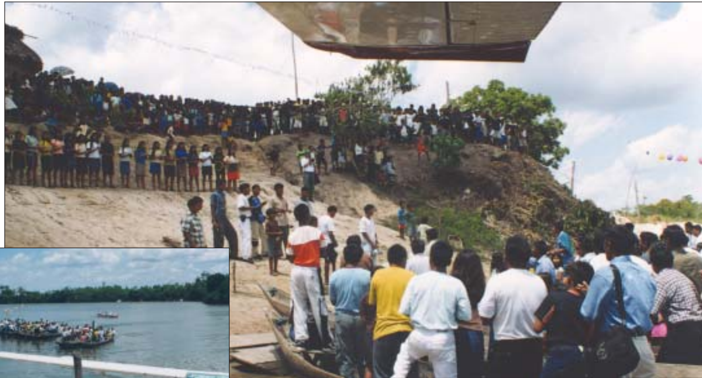
Celebration ... Local Waiwai greet visitors arriving at Mapuera, Brazil. Inset photo shows canoes pulling in after the landing of the MAF floatplane.