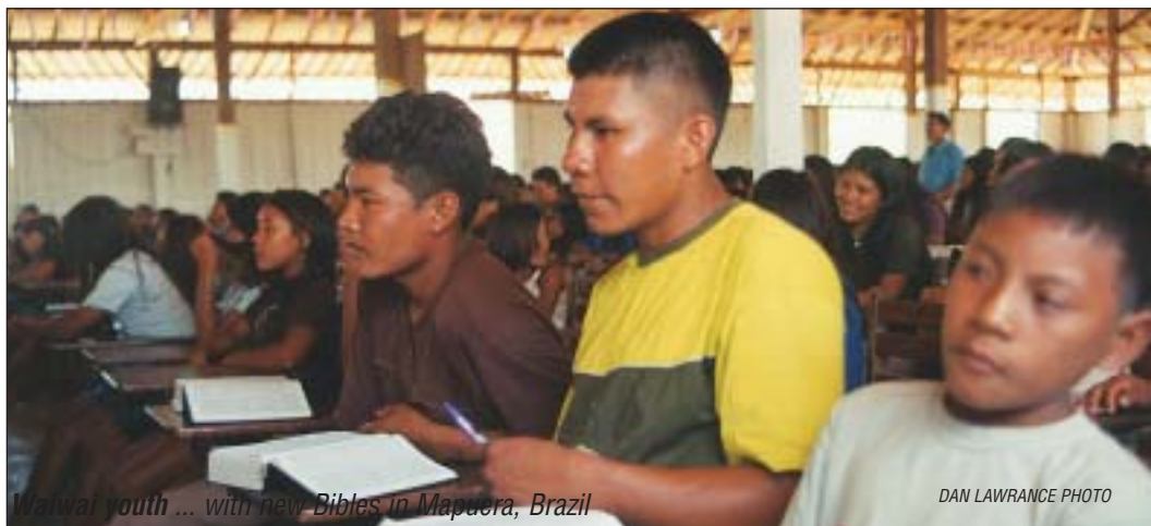
Waiwai youth ... with new Bibles in Mapuera, Brazil