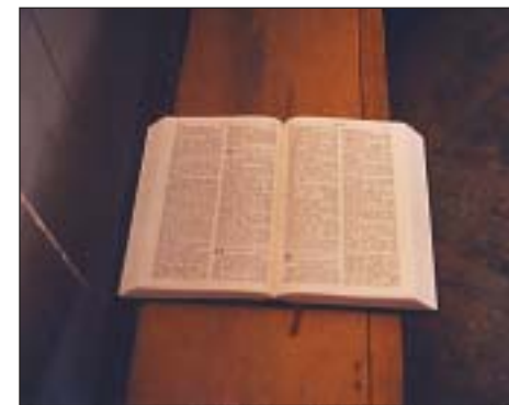
New Waiwai Bible ... opened at Psalm 23

the Brazilian government has banned any more expatriates from serving as missionaries to the native populations of Brazil.